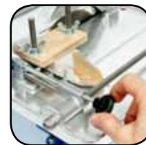
Optional: Adjustable rock vise clamp system cross feed adjustment